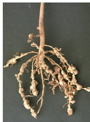
Photo 1. Galls on the roots of Phaseolus bean caused by Meloidogyne species.

Meloidogyne incognita and other species.