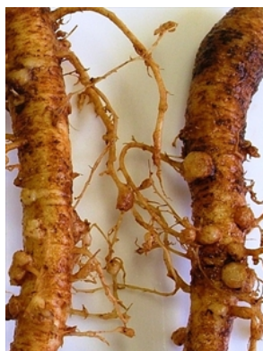
Photo 4. Root knot nematode, Meloidogyne species) galls on parsley.