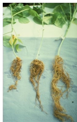
Photo 2. As in Photo 1, galls of Meloidogyne sp. on Phaseolus bean. Note the galls on the roots of the two plants on the left with smaller root mass compared to the healthy plant on the right.