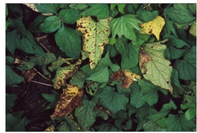
Photo 1. Sweetpotato leaves with leaf spots caused by Pseudocercospora timorensis .

Produced with support from the Australian Centre for International Agricultural Research under project PC/2010/090: Strengthening integrated crop management research in the Pacific Islands in support of sustainable intensification of high-value crop production, implemented by the University of Queensland and the Secretariat of the Pacific Community.