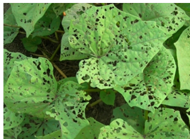
Photo 4. Leaves eaten by sweetpotato red leaf beetle, Candezea palustris .