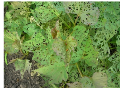
Photo 2. Leaves eaten by sweetpotato red leaf beetle, Candezea palustris .