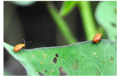
Photo 1. Sweetpotato red leaf beetle, Candezea palustris .

Candezea (Monolepta) species. There has been a recent revision of the genus, so previous records are now in doubt. However, Candezea palustris has been recorded from Solomon Islands.