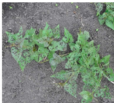
Photo 5. Severe damage on young sweetpotato by sweetpotato red leaf beetle, Candezea palustris .