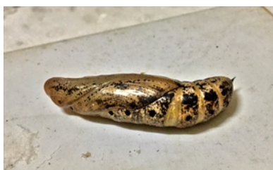
Photo 5. Pupa taro hornworm, Hippotion celerio .