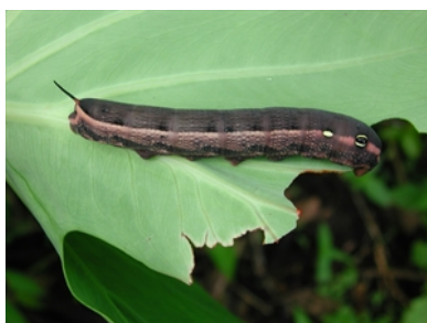
Photo 4. When mature the caterpillars of taro hornworm, Hippotion celerio , are dark brown.