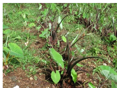
Photo 2. Severe damage to taro caused by the taro hornworm, Hippotion celerio ; the leaves have been eaten leaving only the leaf stalks or petioles.