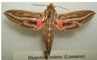
Photo 6. Adult taro hornworm, Hippotion celerio .