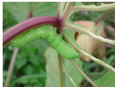
Photo 1. A caterpillar of taro hornworm, Hippotion celerio , eating a leaf and leaving only the veins.

Hippotion celerio . It is a member of the Sphingidae.