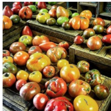
Photo 1. A mix of ripe and unripe fruits showing varying catface symptoms,