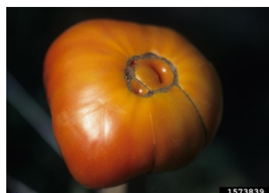
Photo 2. Catface symptom at the blossom end. Note the small outgrowth and the scar tissue.