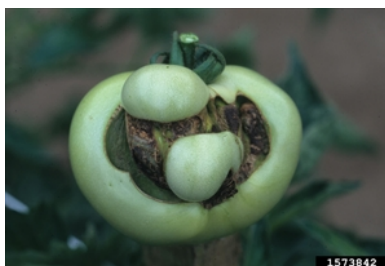
Photo 4. Extreme symptoms of catface deformation and scarring.