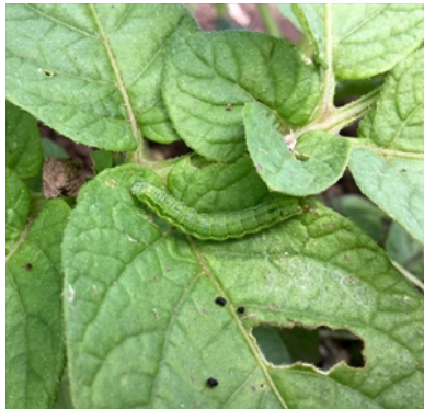
Photo 8. Caterpillar of tomato fruit borer, Helicoverpa armigera , on potato.