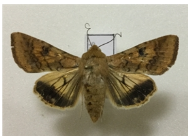
Photo 12. Male Helicoverpa armigera . Note the indistinct inner border of the black markings on the hind wings.