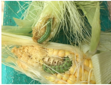
Photo 6. Caterpillars of Helicoverpa armigera , in cobs of maize, showing the dark green stripes along the back and a yellow stripe at the side (more clearly seen on the caterpillar at the top of the photo).