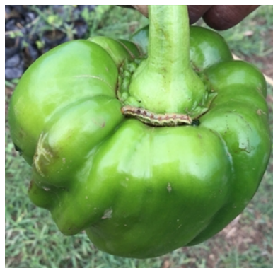
Photo 5. The sloping hind end of the caterpillar and the presence of short stiff hairs sets Helicoverpa armigera apart from Spodoptera litura .