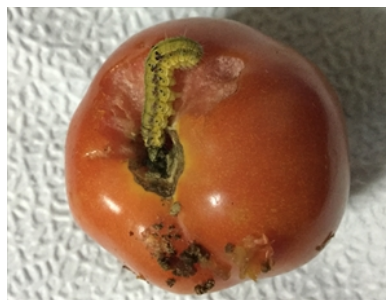
Photo 4. Caterpillar of the tomato fruit borer (corn earworm), Helicoverpa armigera , eating a tomato. Note, hairs on the body can be clearly seen towards the rear of the caterpillar.