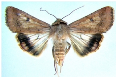
Photo 11. Adult corn earworm, Helicoverpa armigera .