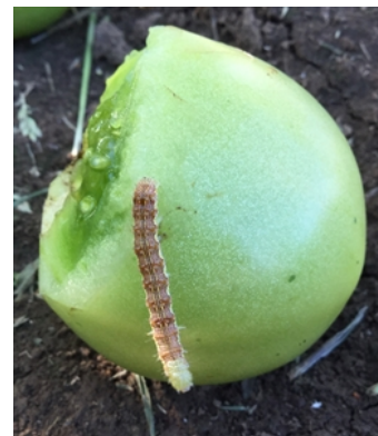
Photo 3. Caterpillar of the tomato fruit borer (corn earworm), Helicoverpa armigera , eating a tomato.