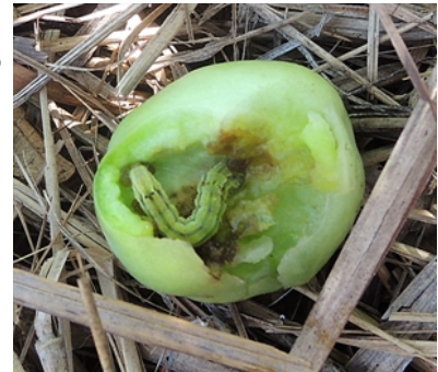
Photo 1. Caterpillar of the tomato fruit borer (corn earworm), Helicoverpa armigera , eating a tomato. Note the three stripes on the top of its body.

Helicoverpa armigera , previously Heliothis armigera .