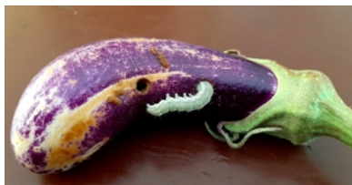
Photo 10. Caterpillar of tomato fruit borer (corn earworm), Helicoverpa armigera , on eggplant.