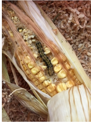
Photo 7. Caterpillar of Helicoverpa armigera in cob of maize. Note, this is much darker than those in Photo 6.