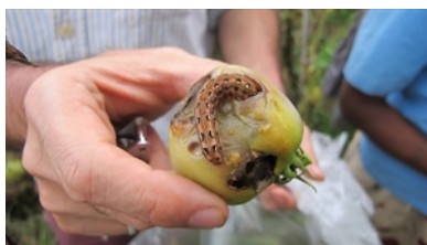
Photo 13. Spodoptera litura provided for comparison.