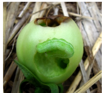
Photo 2. Caterpillar of the tomato fruit borer (corn earworm), Helicoverpa armigera , eating a tomato. Note that there may be considerable variation in the colour and marking of this insect; compare with all the others.