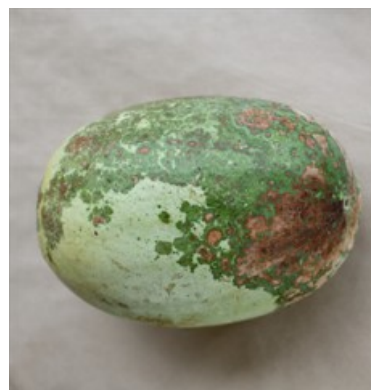
Photo 1. Papaya ringspot virus-W on watermelon (Tonga), showing characteristic ring patterns.