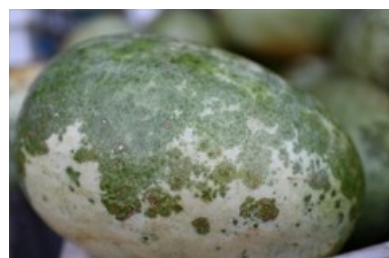
Photo 2. Papaya ringspot virus-W on watermelon (Fiji), showing characteristic ring patterns.