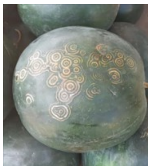
Photo 4. Ringspots of Papaya ringspot virus-W , on dark-skinned variety.

Note, a third virus, Watermelon mosaic virus , also infects watermelon and other cucurbits; this virus causes light and dark mottling on the leaves and a slight roughening of the skin of the fruit. It was previously known as Watermelon mosaic virus-2 .