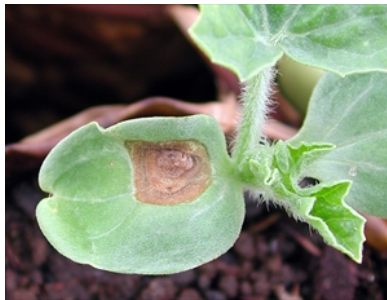
Photo 3. Gummy stem blight infection, Didymella bryoniae , on a seedling. It is just possible to see the black dots that contain the spores in the centre of the spot. Infection of seedlings in the nursery is a major threat to watermelon production as it means the fungus is taken to the field and early infection and spread is guaranteed.

Stagonosporopsis cucurbitacearum ; (previously, Didymella bryoniae ). Also known by the asexual state, Phoma cucurbitacearum or Ascochyta cucumis . The latter is commonly found on plants in the field producing minute oval spores in round black structures in the leaf called 'pycnidia' that are just visible to the naked eye.