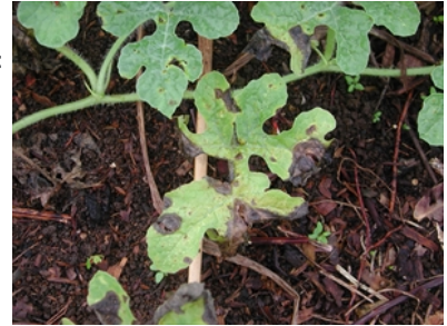
Photo 1. The large black spots are typical of gummy stem blight, Didymella bryoniae , on the leaves. Notice the concentration of the spots at the margins of the leaf where water stays for longer. Some of the spots have joined together.