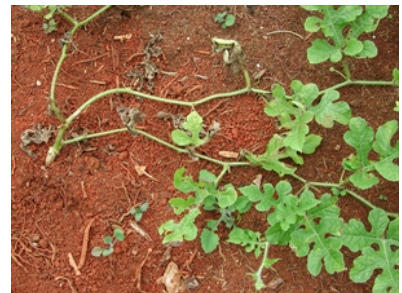
Photo 2. This is typical of the defoliation that occurs with gummy stem blight infection, making it a serious disease. Leaves go yellow, collapse and die when they have only a few spots. The older leaves die first.