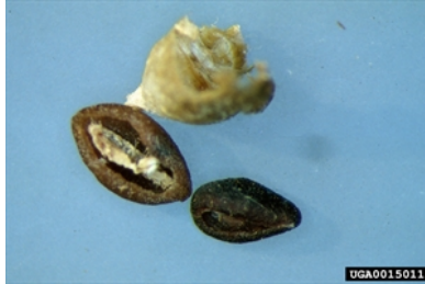
Photos 7. Seeds, winged false buttonweed, Spermacoce latifolia . Note, the deep cavity on one side of the seed (labelled by USDA APHIS PPQ as Spermacoce alata ).