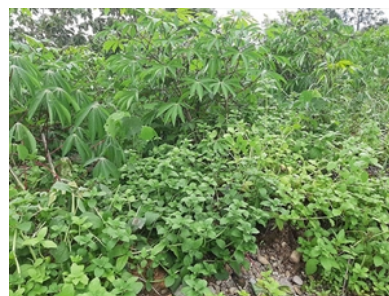
Photo 2. Winged false buttonweed, Spermocoe latifolia , among cassava (Fiji).