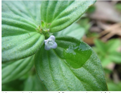
Photo 6. Close-up of flower, winged false buttonweed, Spermacoce latifolia .