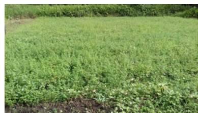
Photo 1. Field of winged false buttonweed, Spermocoe latifolia (Palau).