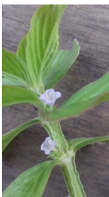
Photo 4. Winged stem (and flowers) of winged false buttonweed, Spermocoe latifolia .

Spermocoe latifolia ; previously, it was known as Borreria latifolia . Note, The Royal Botanic Gardens Kew lists this species separately from Spermocoe alata . According to RBG, Spermocoe latifolia has spread widely from South and Central America, including to the Pacific, whereas Spermocoe alata is a weed of South America alone. Some online websites suggest these two species are the same. It is a member of the Rubiaceae.