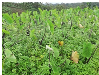
Photo 3. Winged false buttonweed, Spermocoe latifolia , among taro (Fiji).