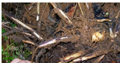
Photo 5. Banana roots with purple/black discoloration caused by Pratylenchus coffeae . Infested roots rot and plants are weak and yields are small.