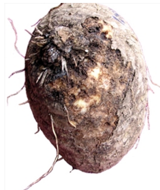
Photo 1. Pratylenchus coffeae in yam causes a shallow rot beneath the skin; the importance of the rot is not only the loss of flesh for eating, it is also the loss of planting material. Yams infected with dry rot do not sprout or, if they do, the cutting will be infested with nematodes which will attack the roots when the setts are planted.