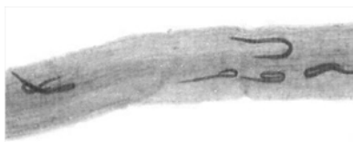
Photo 4. Pratylenchus coffeae inside a root.