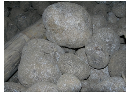
Photo 1. Colonies of the scale, Aspidiella hartii , increase on stored yams turning them whitish-grey.