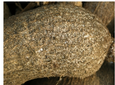
Photo 2. Large numbers of scales, Aspidiella hartii , on the surface of yam, Dioscorea alata .