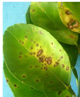
Photo 1. Spots - blister or craters - caused by citrus canker, Xanthomonas citri . Note the spots are surrounded by a yellow halo or margin, and that the leaves are not distorted as they are by citrus scab, Elsinoë fawcettii .

Bacterial canker is the most important disease of the citrus. It is of great concern to countries that have citrus industries that are yet free from the disease. Major citrus-growing countries, Australia, Brazil, and the USA, have all had incursions of the disease, some more than once, which have been extremely costly in efforts to eradicate. Some attempts have been successful, others not. The attempt to eradicate the 1995 introduction of the disease to Florida failed and was called off in 2006. Australia has been more fortunate and Queensland was declared free from the disease in 2009 after the destruction of large numbers of citrus of all kinds - commercial and backyard.