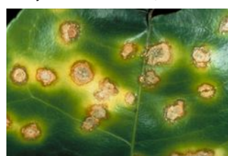
Photo 2. Close-up of the pustules formed by citrus canker, Xanthomonas citri , showing yellow haloes.