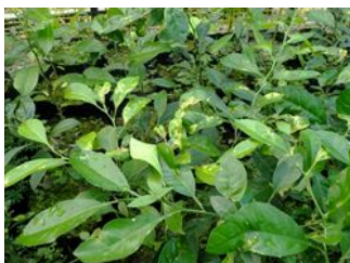
Photo 6. Citrus root stocks infected with citrus canker, Xanthomonas citri .