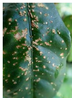
Photo 3. Top side of the leaf showing pustules of citrus canker, Xanthomonas citri , without haloes.