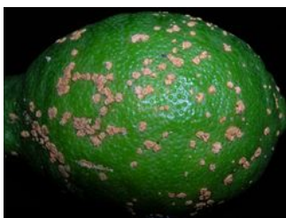
Photo 5. Raised pustules on the surface of a lemon, caused by citrus canker, Xanthomonas citri , without yellow haloes.

When using a pesticide, always wear protective clothing and follow the instructions on the product label, such as dosage, timing of application, and pre-harvest interval. Recommendations will vary with the crop and system of cultivation. Expert advice on the most appropriate pesticides to use should always be sought from local agricultural authorities.