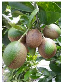
Photo 1. Citrus rust mite, Phyllocoptura oleivora , on limes, clearly showing the contrast between the damaged and health parts of the fruit.

Look for the mites using a hand lens (x10 or higher magnification). Examine small fruit on inside of the canopy, looking at the stem end of the fruit, in particular. Look to see if the mites are all over the fruit; if so, numbers of mites are high. If damage is seen, that means that large numbers of mites are present already, and it may be too late to spray.