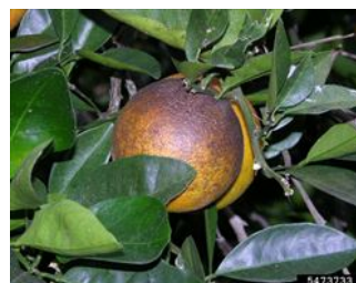
Photo 2. Citrus rust mite, Phyllocoptura oleivora , damage on an orange.