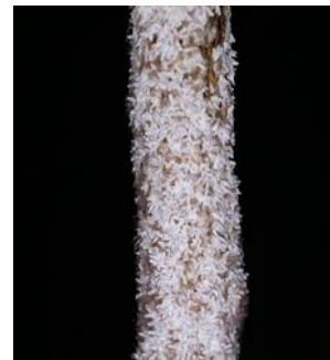
Photo 2. Male pupae on citron, citrus snow scale, Unaspis citri .