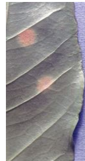
Photo 2. Yellow-orange spots on the underside of a coffee leaf caused by coffee rust, Hemileia vastatrix . The spots have started to form powdery spores.