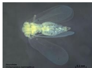
Photo 2. Adult croton whitefly, Orchamoplatus mammaeferus .