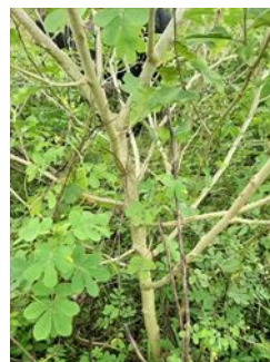
Photo 3. Stem and branches, devil's fig, Solanum torvum , showing the thorns.