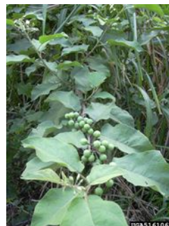
Photo 4. Thorns on the stems at the back of the photograph, devil's fig, Solanum torvum . Note, the shape of the leaves: near oval and with short leaf stalk. (Fruit also present.)