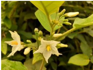
Photo 5. Flowers, devil's fig, Solanum torvum .

----- When using a pesticide, always wear protective clothing and follow the instructions on the product label, such as dosage, timing of application, and pre-harvest interval. Recommendations will vary with the crop and system of cultivation. Expert advice on the most appropriate herbicides to use should always be sought from local agricultural authorities.