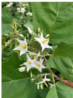
Photo 7. Flowers, devil's fig, Solanum torvum .