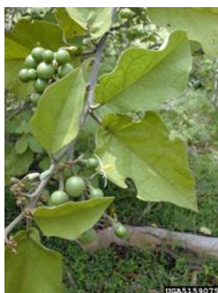
Photo 8. Fruits, devil's fig, Solanum torvum .