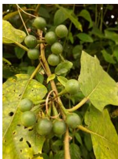
Photo 9. Close-up fruits, devil's fig, Solanum torvum .