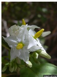
Photo 6. Flowers, devil's fig, Solanum torvum .