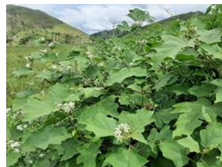
Photo 1. Thicket of devil's fig, Solanum torvum .

It is sometimes cultivated for its edible fruits, and is used in Thai, Loa, Indian and Jamaican cuisine, in soups sauces, pastes and curries. Used as an ornamental and as a root stock to avoid wilt diseases. The weed has a large number of medicinal uses, both for external and internal conditions.