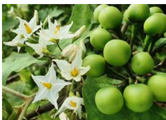
Photo 10. Flowers and fruits, devil's fig, Solanum torvum .