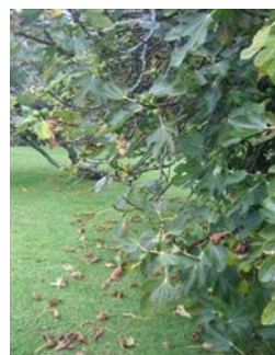
Photo 4. Fig tree infected by the fig rust fungus, Cerotelium fici , causing premature leaf fall.