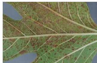
Photo 1. Pustules on the underside of a breadfruit leaf, caused by fig rust, Cerotelium fici .

When using a pesticide, always wear protective clothing and follow the instructions on the product label, such as dosage, timing of application, and pre-harvest interval. Recommendations will vary with the crop and system of cultivation. Expert advice on the most appropriate pesticide to use should always be sought from local agricultural authorities.