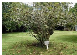
Photo 3. Fig tree partly defoliated by the fig rust fungus, Cerotelium fici .