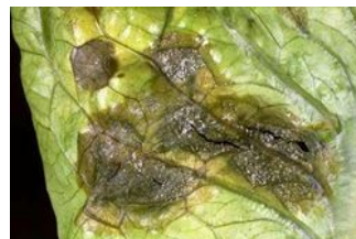
Photo 1. Brown patches on lettuce caused by downy mildew, Bremia lactucae .

Look for the yellowish angular spots on the top of the older leaves, and white fungal-like growth on the underside. Look for spots that turn brown as they age.