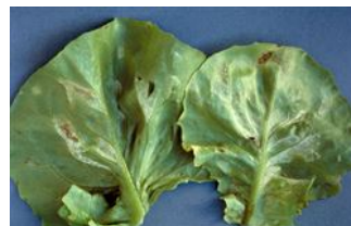
Photo 2. Downy mildew, Bremia lactucae , on lettuce showing sporulating areas between the main veins.