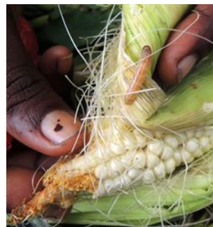
Photo 1. Caterpillar of the Asian corn borer, Ostrinia furnacalis , inside a maize cob. The caterpillars are pinkish-brown.

Look for plants that are wilting. Look for small piles of frass on the stems or cobs. If there are entry holes, open the stem and cob (Photo 1) and look for the pink caterpillar with pink-brown spots on the back.