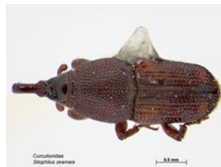
Photo 2. Maize weevil, Sitophilus zeamais ; adult, view from above.