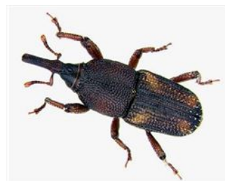
Photo 3. Maize weevil, Sitophilus zeamais , clearly showing four light reddish to yellowish spots at the corners of the wing case.