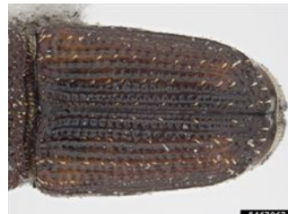
Photo 4. Maize weevil, Sitophilus zeamais ; another view of the four (very) faint, reddish spots at the corner of the wing case.