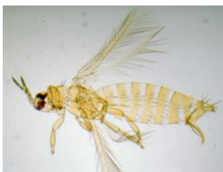
Photo 6. Adult thrips, Thrips palmi , are about 1 mm long, narrow, yellow with two pairs of wings.