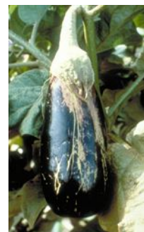
Photo 4. Scars on the surface of an eggplant fruit due to feeding of thrips, Thrips palmi , when the fruit was young.