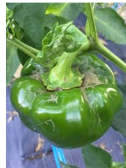
Photo 3. Typical scaring caused by Thrips palmi on capsicum fruit while it was still in the bud.