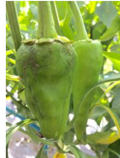
Photo 1. Warty scaring at the calyx end of the chilli fruit caused by Thrips palmi , while the fruit was still in the bud.

Look for insects that are very small, narrow, and just visible to the naked eye. The adults are yellow, with wings; the nymphs are yellow or white, without wings. Look for the silvery or bronzing of the top surfaces of leaves, especially along the midribs and veins.