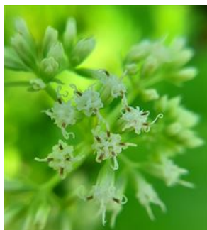
Photo 5. Flowers showing the protruding stamens, mile-a-minute, Mikania micrantha .

When using a pesticide, always wear protective clothing and follow the instructions on the product label, such as dosage, timing of application, and pre-harvest interval. Recommendations will vary with the crop and system of cultivation. Expert advice on the most appropriate herbicides to use should always be sought from local agricultural authorities.