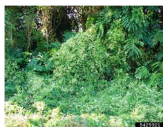
Photo 2. Mile-a-minute, Mikania micrantha , typically smothering other weeds, and scrambling into and over trees.