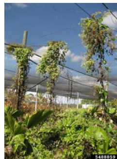
Photo 1. Mile-a-minute, Mikania micrantha , smothering other plants and climbing up poles and wires.

There is a view, in some Pacific island countries, that mile-a-minute is preferable to the many alternative weeds that might occupy the space if mile-a-minute were controlled. It is relatively easy to slash, roll up and remove. However, in Vanuatu, it has been estimated that in new forestry plantings, mile-a-minute and Merremia (see Fact Sheet no. 446 ) together require 106 days of hand weeding per hectare over the first 3 years. Also, mile-a-minute produces toxins which, when released into the soil, reduce the growth of other agricultural crops and native vegetation (allelopathy). In addition, surveys in Papua New Guinea before the release of the rust fungus, Puccinia spegazzinii , found that 40% of the respondents considered that the weed reduced crop yields by more than 30%. In Fiji, the figures were 65% of respondents and 30% of potential crop yield. In Southeast Asia, too, there are reports of the high cost of control in plantations of tea, cocoa, oil palm and rubber. Cost to the plantation industries in Malaysia were nearly $US10 million in 1985, so costs today would be several times higher.