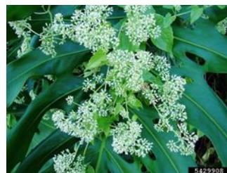
Photo 4. Mile-a-minute, Mikania micrantha , flowers.