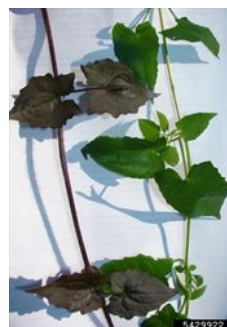
Photo 3. Mile-a-minute, Mikania micrantha , stem and leaves.