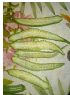
Photo 4. Internal appearance of distorted okra pods (see Photo 4).