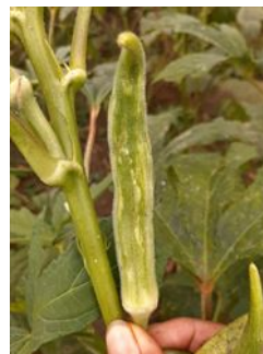
Photo 1. Bumps and ridges on okra pods, some in lines, caused by unknown condition (Fiji).

Until the cause of the condition is known, no recommendations can be provided.