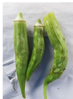
Photo 2. Numerous bumps and ridges on okra pods causing distortions (Fiji).