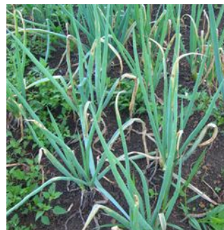
Photo 1. Purple blotch, Alternaria porri , causing spots on leaves of shallots.

Look for the characteristic large brown to purple blotches. Look for tips of leaves that blacken and hang down, wither and die.