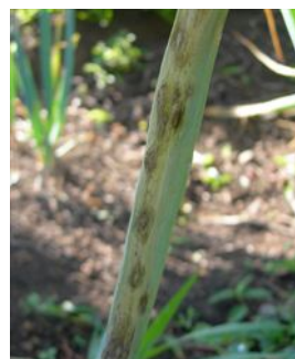
Photo 2. Purple blotch, Alternaria porri , on leaves of shallots showing zoned spots. Spores are produced in large numbers on these spots.