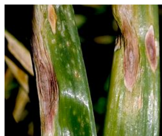
Photo 4. Purple blotch caused by Alternaria porri , on onion. The large spots are oval, purple and up to 150 mm long.