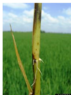
Photo 3. Roots from lower nodes on plant with bakanae disease, Gibberella fujikuroi .