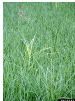
Photo 1. Bakanae disease, Gibberella fujikuroi , as it appears in the field.

Look for abnormally tall thin yellowish-green plants in the nursery and field. Look for white fungal growth at the base and lower parts of tillers. Strip away the leaf sheaths and look for pink to purple nodes on the stems. Look for roots at the nodes. Standard seed health protocols exist for this disease.