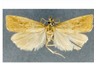
Photo 2. Adult gold-fringed rice borer, Chilo auricilius (female).