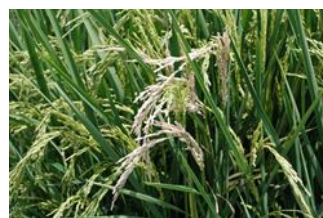
Photo 4. 'Whitehead' - a symptom caused by stem borers: the base of the panicle is damaged preventing it from emerging or, if already emerged, the grain is unfilled and white.