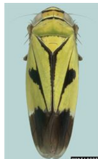
Photo 1. Adult rice green leafhopper, Nephotettix nigropictus .

Look for the black spots on the centres and tips of the wings, and, also, three parallel bands across the head, best seen from above. An entirely green form also exists, but black lines on the head distinguish it from other leafhoppers. Note, that regrowth of plants after harvest is a good time to determine the presence of disease.