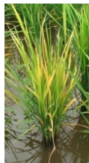
Photo 3. Rice plant with symptoms of rice tungro disease.