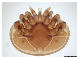
Photo 1. Underside of adult varroa mite, Varroa jacobsoni .

The Asian honeybee and the mite have evolved together, and because of this the bee has adapted to withstand varroa mite infestations. To reduce the impact of the mite, the workers remove them from the brood and brood cells. They do not normally reproduce on European honeybees, but exceptions have been found. The impact of these new strains is not yet known, but is likely to be considerable, leading to reduced honey production and pollination of food crops.