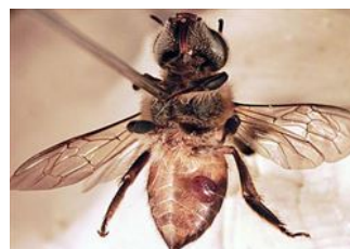
Photo 3. Varroa jacobsoni on an Asian bee, Apis cerana .