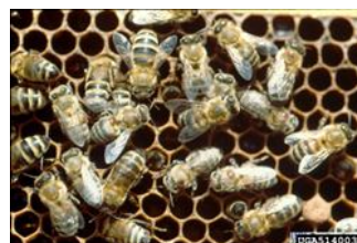
Photo 2. Varroa jacobsoni on Asian bees, Apis cerana .