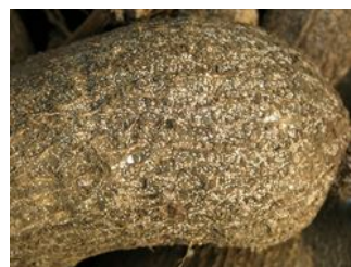
Photo 2. Large numbers of scales, Aspidiella hartii , on the surface of yam, Dioscorea alata .