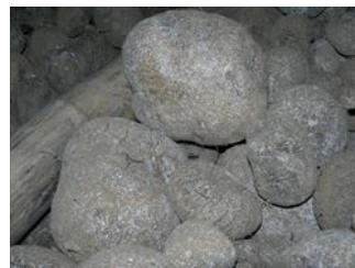
Photo 1. Colonies of the scale, Aspidiella hartii , increase on stored yams turning them whitish-grey.

Look for yams that have a light brown to grey appearance in storage. Use a hand lens to look for the scales, less than 1-2 mm diameter. They cannot be seen clearly with the naked eye.