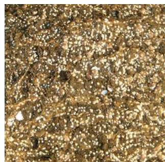
Photo 3. Close-up of Photo 2 showing the scales of different sizes - presumably males and females.