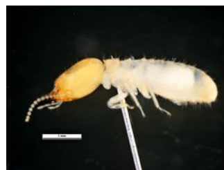
Photo 1. Side view of soldier, Asian subterranean termite, Coptotermes gestroi .

Produced with support from the Australian Centre for International Agricultural Research under project HORT/2016/18: Responding to emerging pest and disease threats to horticulture in the Pacific islands , implemented by the University of Queensland and the Pacific Community.