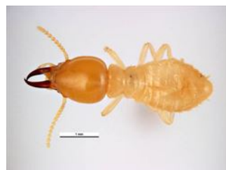
Photo 2. Top view of soldier, Asian subterranean termite, Coptotermes gestroi .