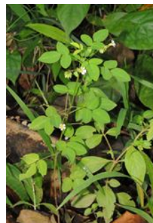
Photo 1. General structure of Barrelier's woodsorrel, Oxalis barrelieri , stems, leaves and flowers.

Oxalis barrelieri ; previously, it was known as Oxalis bahiensis . It is a member of the Oxalidaceae.