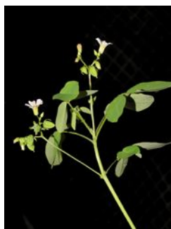
Photo 4. Form of leaves and developing flowers and fruits, Barrelier's woodsorrel, Oxalis barrelieri .