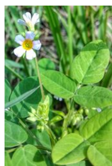
Photo 2. Leaves and flowers, Barrelier's woodsorrel, Oxalis barrelieri .