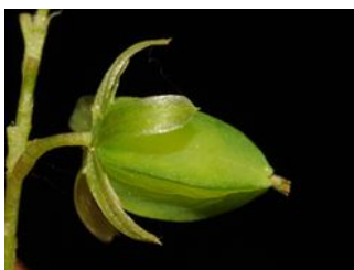
Photo 5. Lance-shaped sepals - forming the leaf-like calyx - at the base of a developing fruit, Barrelier's woodsorrel, Oxalis barrelieri .

AUTHORS Grahame Jackson & Makereta Ranadi