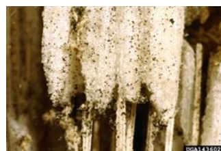
Photo 2. Sclerotia of charcoal rot, Macrophomina phaseolina on maize stem.