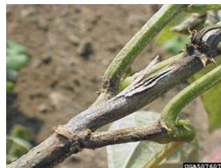
Photo 1. Brown to grey area of infection covering the entire lower stem and girdling the plant caused by charcoal rot, Macrophomina phaseolina . Tiny black dots are the sclerotia.

Produced with support from the Australian Centre for International Agricultural Research under project PC/2010/090: Strengthening integrated crop management research in the Pacific Islands in support of sustainable intensification of high-value crop production , implemented by the University of Queensland and the Secretariat of the Pacific Community.