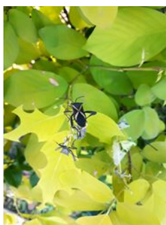
Photo 5. Adult crusader bug, Mictis profana .