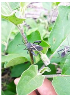
Photo 4. Adult crusader bug, Mictis profana , on eggplant.