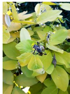
Photo 1. Adult crusader bug, Mictis profana , causing wilts on unidentified weed (Vanuatu).

Mictis profana . In Australia, Mictis caja and Mictis difficilis are also present. It is a coreid bug, and a leaf-footed species.