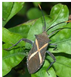
Photo 3. Adult crusader bug, Mictis profana .