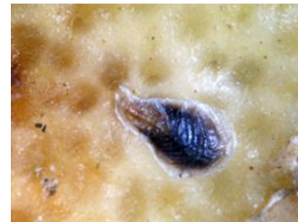
Photo 1. Female citrus snow scale, Unaspis citri . The female is very different from the male; it is oval, brown-black and 2 mm long, whereas the male is 1 mm, and white.