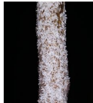
Photo 2. Male pupae on citron, citrus snow scale, Unaspis citri .