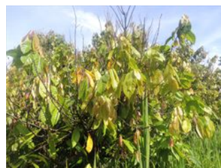
Photo 1. Branch dieback and yellowing of the leaves due to sunscald of cocoa caused by exposure - lack of shade - and poor nutrition.

There are no scientific name for these physiological conditions: i) reaction of trees to lack of shade, and sun damage, and ii) early death of cherelles by a natural fruit-thinning process.