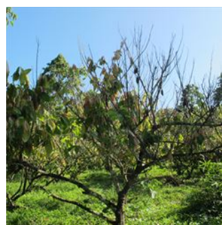
Photo 2. Severe branch dieback due to lack of shade and adequate nutrition.