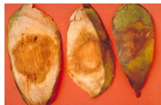
Photo 3. Slices from nuts (Photo 2) showing internal infections by Phytophthora hevae .