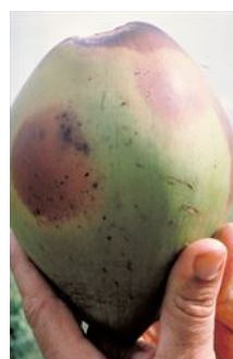
Photo 2. Nuts are also infected by coconut bud rot causing premature nutfall. In this case, Phytophthora hevae was isolated from the rot.