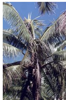
Photo 1. Bud rot of coconut showing the collapse of the spear and younger leaves due to infection by Phytophthora palmivora , while the older leaves appear relatively healthy at this time.

Phytophthora palmivora . Note, there may be more than one species of Phytophthora in the Pacific islands causing bud rot. For instance, Phytophthora hevae is also said to occur, causing a bud and nut rot of coconuts in New Caledonia (Photos 2&3).