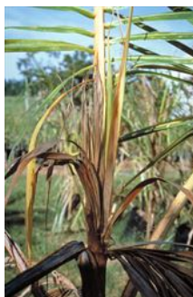
Photo 4. Basal stem rot of coconut seedling, caused by Phytophthora palmivora .