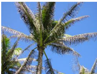
Photo 5. Single coconut palm to show the extensive leaf damage when attacked by the coconut leafminer, Promecothea species.