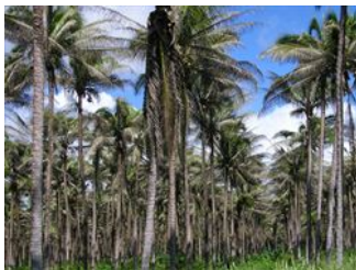
Photo 4. Extensive leaf decay in a