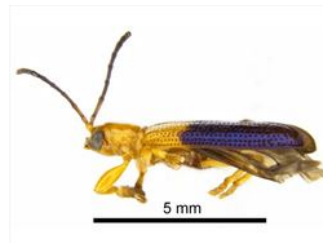
Photo 3. Adult Fiji coconut hispid, Promecothea caerulipennis .