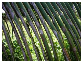
Photo 2. Large areas of decay on coconut leaflets after the leaves have been attacked by the coconut leafminer, Promecothea species.