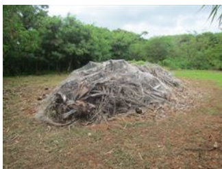
Photo 14. Trapping coconut rhinoceros beetle, Oryctes rhinoceros . Breeding sites are heaps of old fronds or other organic matter; they are covered by a gill net, and the beetles get caught in the mesh when entering or leaving the heaps.