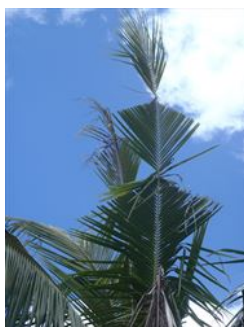
Photo 4. Close up of characteristic shape of fronds eaten by adult coconut rhinoceros beetle, Oryctes