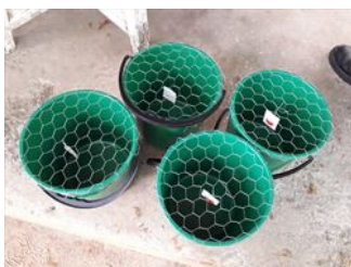
Photo 15. Bucket traps for coconut rhinoceros beetles, Oyctes rhinoceros , with chicken-wire covers and pheromone (Fiji).