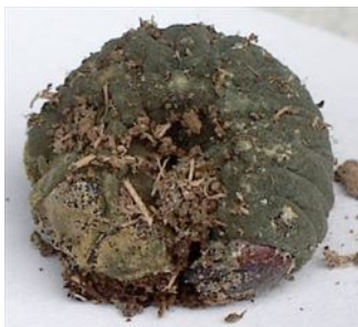
Photo 13. The grub or larva of a coconut rhinoceros beetle, Oryctes rhinoceros , infected by the fungus Metarhizium (Guam). The green areas are where the fungus is sporulating.