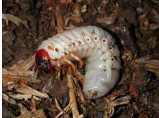
Photo 8. Close-up of the larva of a coconut rhinoceros beetle, Oryctes rhinoceros . Note that the C-shape grubs or larvae grow up to 100 mm.