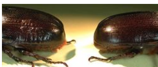
Photo 12. Close-up of the hind end of the coconut rhinoceros beetle, Oryctes rhinoceros . Female, with abundant hairs at the tip (left); male (right).