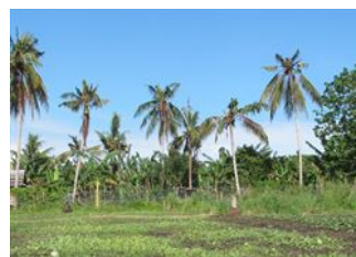
Photo 3. The damage from Oryctes rhinoceros in Solomon Islands is so severe that palms are dying from the attack.