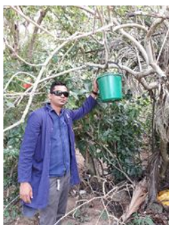
Photo 16. Bucket traps for coconut rhinoceros beetles, Oyctes rhinoceros , placed above ground. About 2 m above ground is ideal.