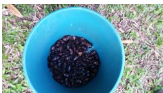
Photo 17. Bucket trap with catch of coconut rhinoceros beetles, Oryctes rhinoceros .