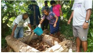
Photo 18. An artificial breeding site inoculated with spores of Metarhizium anisopliae , in order to infect larvae of the rhinoceros beetle, Oryctes rhinoceros (Fiji).