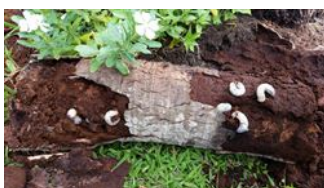
Photo 6. Larvae of coconut rhinoceros beetle, Oryctes rhinoceros , in a rotten coconut trunk. A favourite breeding site, especially in still standing but decaying palms (Fiji).