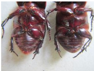
Photo 11. Underside of adult coconut rhinoceros beetle, Oryctes rhinoceros , to show the fuzzy group of hairs at the rear end of the female (left) compared to the male (right).