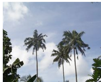
Photo 1. Characteristic damage done by the coconut rhinoceros beetle, Oryctes rhinoceros , showing V or wedge-shaped sections missing from the fronds eaten by the adults as they tunnel into the crowns of mature palms. (Solomon Islands)

Oryctes rhinoceros . Several strains are recognised. In Pacific islands