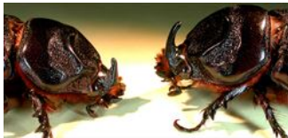
Photo 10. Close-up of the head end of the coconut rhinoceros beetle, Oryctes rhinoceros . Male (right), female (left).