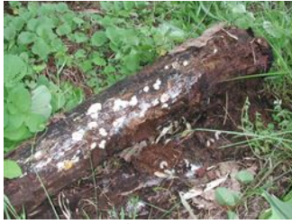
Photo 7. Larvae of coconut rhinoceros beetle, Oryctes rhinoceros , under a log of unknown tree species.