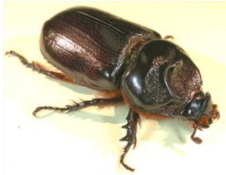
Photo 9. The adult is jet-black, up to 40 mm long with a prominent horn. Both male and female beetles vary in size, and size cannot be used to distinguish the sexes.