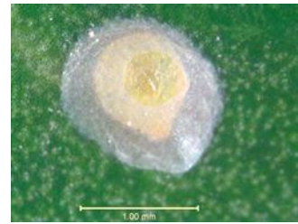
Photo 2. Female coconut scale, Aspidiotus destructor . Note that the body of the insect can be seen beneath the scale, hence the alternative name of 'transparent scale'.