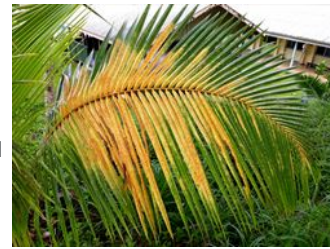
Photo 1. Coconut frond showing damage due to coconut scale, Aspidiotus destructor .