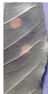
Photo 2. Yellow-orange spots on the underside of a coffee leaf caused by coffee rust, Hemileia vastatrix . The spots have started to form powdery spores.