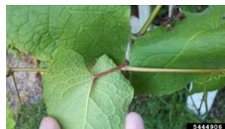
Photo 3. Underside of leaf of coral creeper, Antigonon leptopus , showing the characteristic petiole.