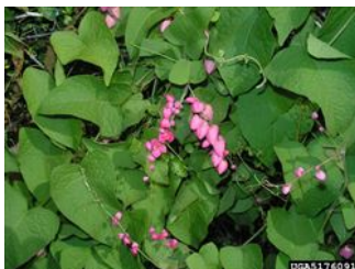
Photo 4. Leaves, flower and terminal tendrils, coral creeper, Antigonon leptopus .

Antigonon leptopus . It is a member of the Polygonaceae.