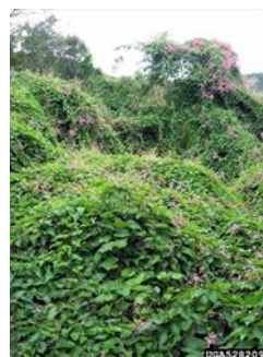
Photo 2. Smothering mass of coral creeper, Antigonon leptopus .