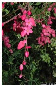
Photo 5. Flowers, coral creeper, Antigonon leptopus .