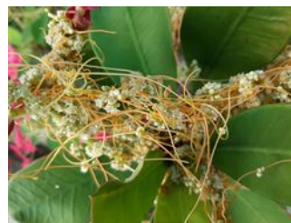
Photo 3. Close-up of flowers of dodder, Cuscuta campestris , on Euphorbia milii .