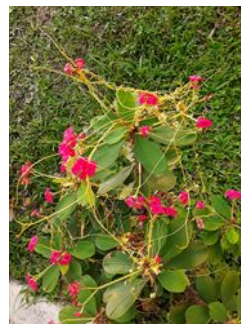
Photo 1. Dodder, Cuscuta campestris , growing over Euphorbia milii .