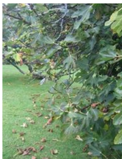
Photo 4. Fig tree infected by the fig rust fungus, Cerotelium fici , causing premature leaf fall.