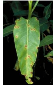
Photo 1. Leaf spot on kangkong ( Ipomoea aquatica ) caused by Cercospora ipomoeae .

Cercospora ipomoeae ; also recorded as Cercospora bataticola .