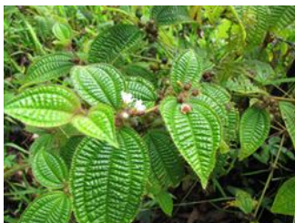
Photo 4. Flowers and developing fruits, Koster's curse, Clidemia hirta .