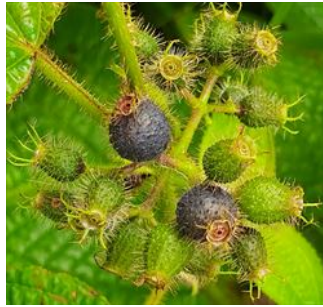
Photo 7. Fruits, Koster's curse, Clidemia hirta , showing hairs and bristles on fruits and leaf stalks.