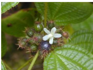
Photo 5. Flowers and fruits, Koster's curse, Clidemia hirta .