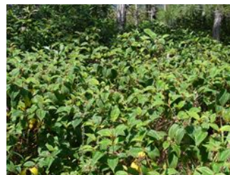
Photo 1. Mass of seedlings of Koster's curse, Clidemia hirta .

Clidemia hirta . It was known previously as Clidemia elegans , Melastoma elegans . It is a member of the Melastomataceae.