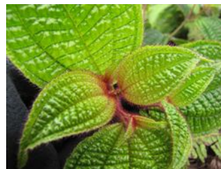
Photo 2. Leaves, Koster's curse, Clidemia hirta . Note, the distinctive veins patterns.