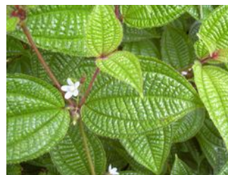
Photo 3. Flowers, Koster's curse, Clidemia hirta . Note, the five petals.