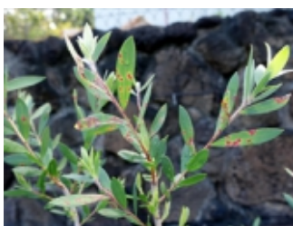
Photo 4. Red-purple spots, myrtle rust, Austropuccinia psidii (as Puccinia psidii ), on paperbark tree (Hawaii).