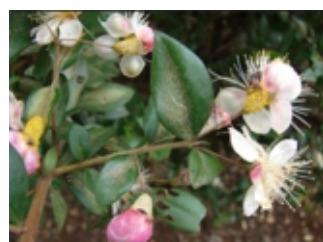
Photo 3. Myrtle rust, Austropuccinia psidii (as Puccinia psidii ), forming spores (urediniospores), on the calyx tube around the ovary of Myrtus communis (Hawaii).