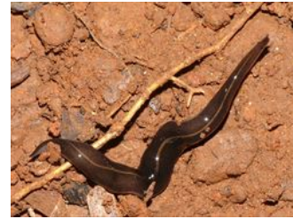
Photo 1. The New Guinea flatworm, Platydemus manokwari . The head is on the right.