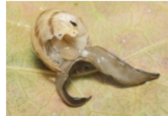
Photo 2. The New Guinea flatworm, Platydemus manokwari , feeding on a snail. The flatworm uses a white cylindrical tube to feed that is visible on the underside.