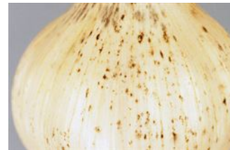
Photo 1. Spots over an onion bulb caused by smudge, Colletotrichum circinans .

Produced with support from the Australian Centre for International Agricultural Research under project PC/2010/090: Strengthening integrated crop management research in the Pacific Islands in support of sustainable intensification of high-value crop production , implemented by the University of Queensland and the Secretariat of the Pacific Community.