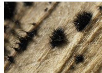
Photo 3. Stiff long hairs within the spore masses of the smudge fungus, Colletotrichum circinans ; they can be seen with a hand lens.