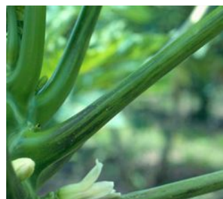
Photo 2. Dark green stripes on leaf stalks of papaya, caused by Papaya ringspot virus - type P.