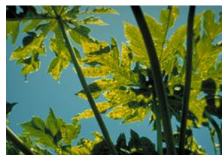
Photo 1. Leaf symptoms on leaves of papaya affected with Papaya ringspot virus - type P. Note the leaves with light yellow and green patches (mosaics), and the deformed leaf on the left.

Produced with support from the Australian Centre for International Agricultural Research under project PC/2010/090: Strengthening integrated crop management research in the Pacific Islands in support of sustainable intensification of high-value crop production , implemented by the University of Queensland and the Secretariat of the Pacific Community.